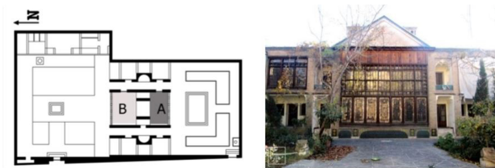
Fig. 2: Ground floor plan and facade of Qavam al-Dowleh house in Tehran (Zand, 2001).

According to pictures and reviews of the two mansions introduced during the first Qajar period, In Table 2, the mentioned indices are examined separately for the first two buildings of the Qajar period.