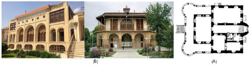
Fig.8: Azizieh or Malijek Mansion. (A) The plan of Malijek Palace. (Source: Saadati Khamseh, 2016) (B) The facade of Malijek Mansion. (Source: Zakarzadeh, 2008).