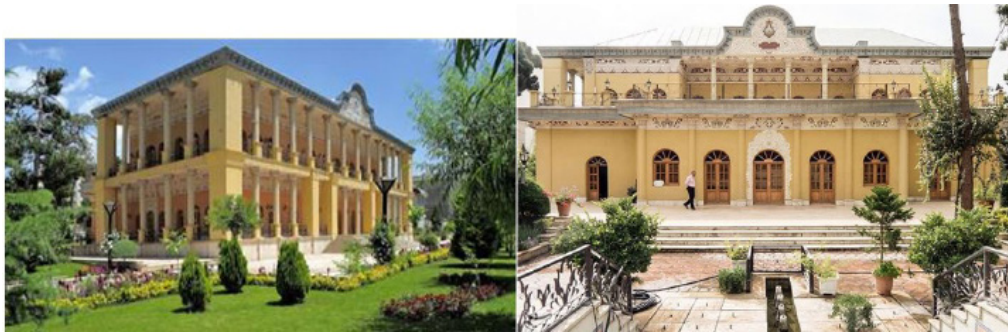
Fig. 7: Ein al-Dowleh Mansion (Municipality of District 4, 2016)

According to pictures and reviews of the two mansions introduced during the first Qajar period, In Table 4, the mentioned indices are examined separately for the two buildings of the third Qajar period.