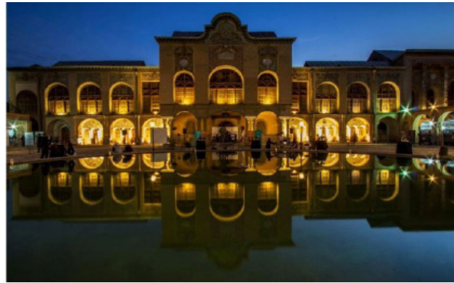
Fig. 6: Masoudieh Mansion