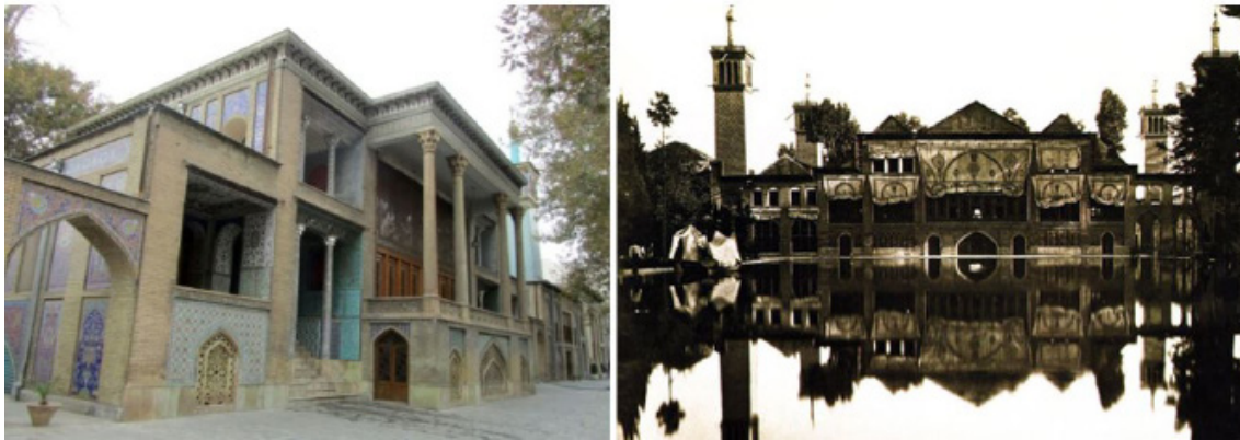
Fig. 4: Badgir Mansion (Ghobadian, 2013)