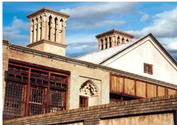
Fig.3: Street View of Qavam al-Dowleh House