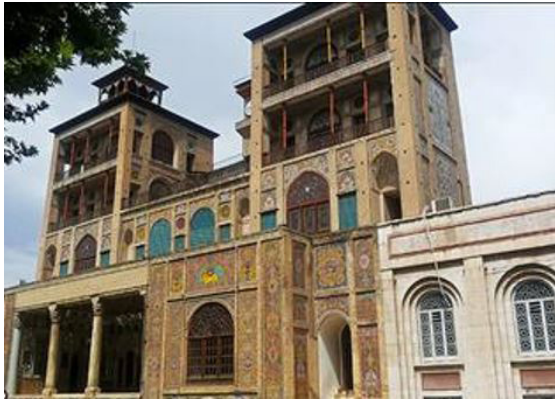
Fig.5: Shams al-Amara (Karimi, 2014)